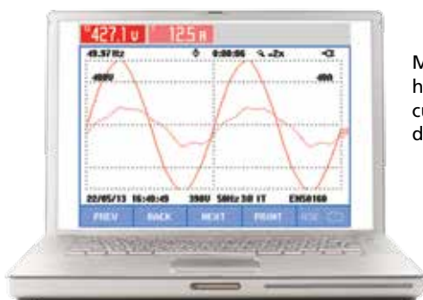
Minimal harmonic current demand