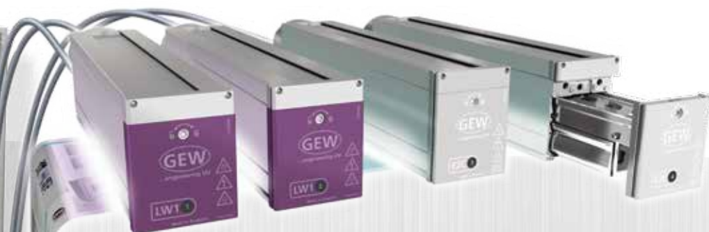
LEDs and Arc Lamps operating as one system