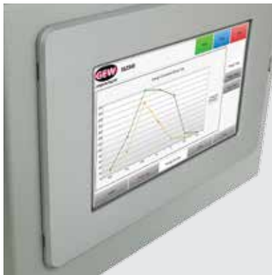
Energy usage monitor