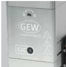
Arc lamp cassette