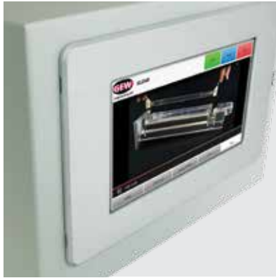
Embedded video tutorials