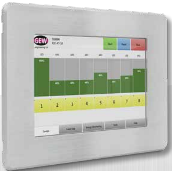
Intuitive, common interface for arc & LED UV lamps